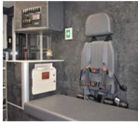
Medic in Mind single seating utilizing 6 point harness