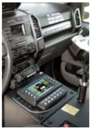
VMUX Vista Screen in Type I Console