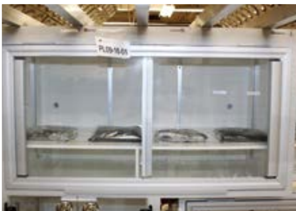
Cabinet testing to SAE J3058 for content retention at 26 G force

Successful dynamic testing provides cabinet content weight ratings