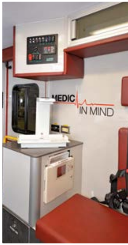
Curb side full switch panel for Medic in Mind