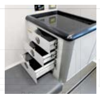
ALS Drawers in rear Medic in Mind Counter