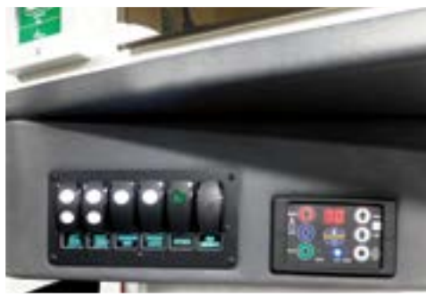
Auxiliary switch panel and thermostat curb side