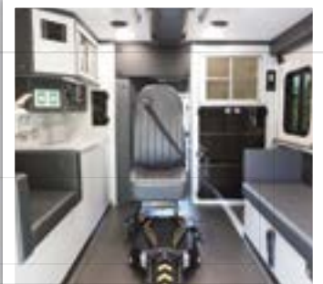
Spacious working interior