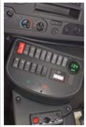
Multiplex electrical system with CAN BUS switching