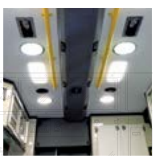
Centrally ducted climate control with unmatched performance