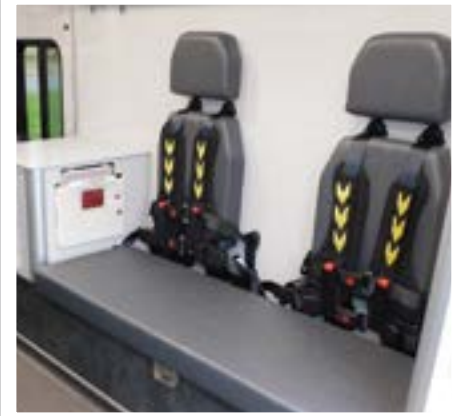
Multiple seating curb side bench with 6 point harness and contoured headrest