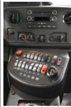
Conventional electrical system with elliptical console design