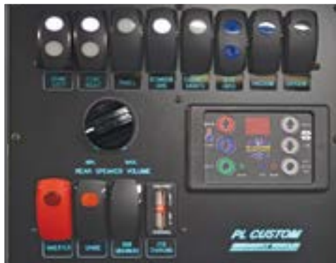
Conventional electrical and programmable thermostat in Life Support system