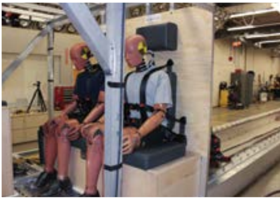
Occupant restraint testing to SAE J3026 for Head Injury Criteria (HIC)

Successful occupant restraint testing of 6 point belt system