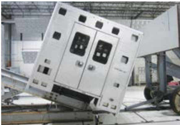
Modular body testing to SAE J3057 – platen impact on upper corner of body

Certified to SAE Ambulance testing requirements