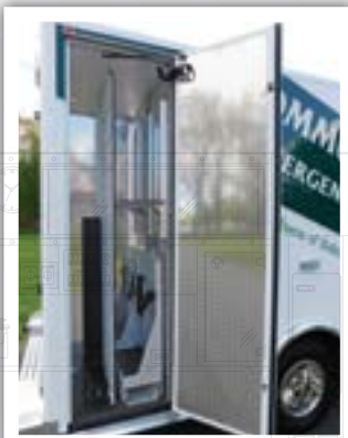
Custom tool board mount in E compartment for stair chair