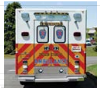
PL Custom rear step design. The step fully recesses under body in the event of impact