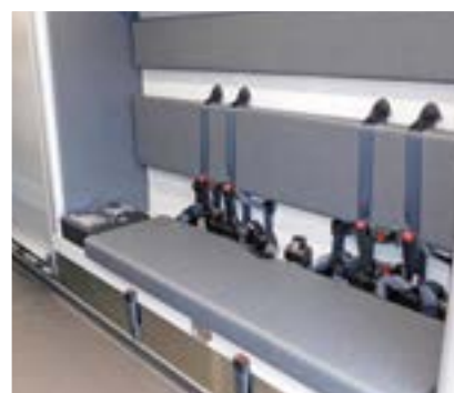
Full length squad bench seat with 6 point Harness