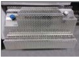
Custom designed diamond plate cab step with fuel and DEF covers